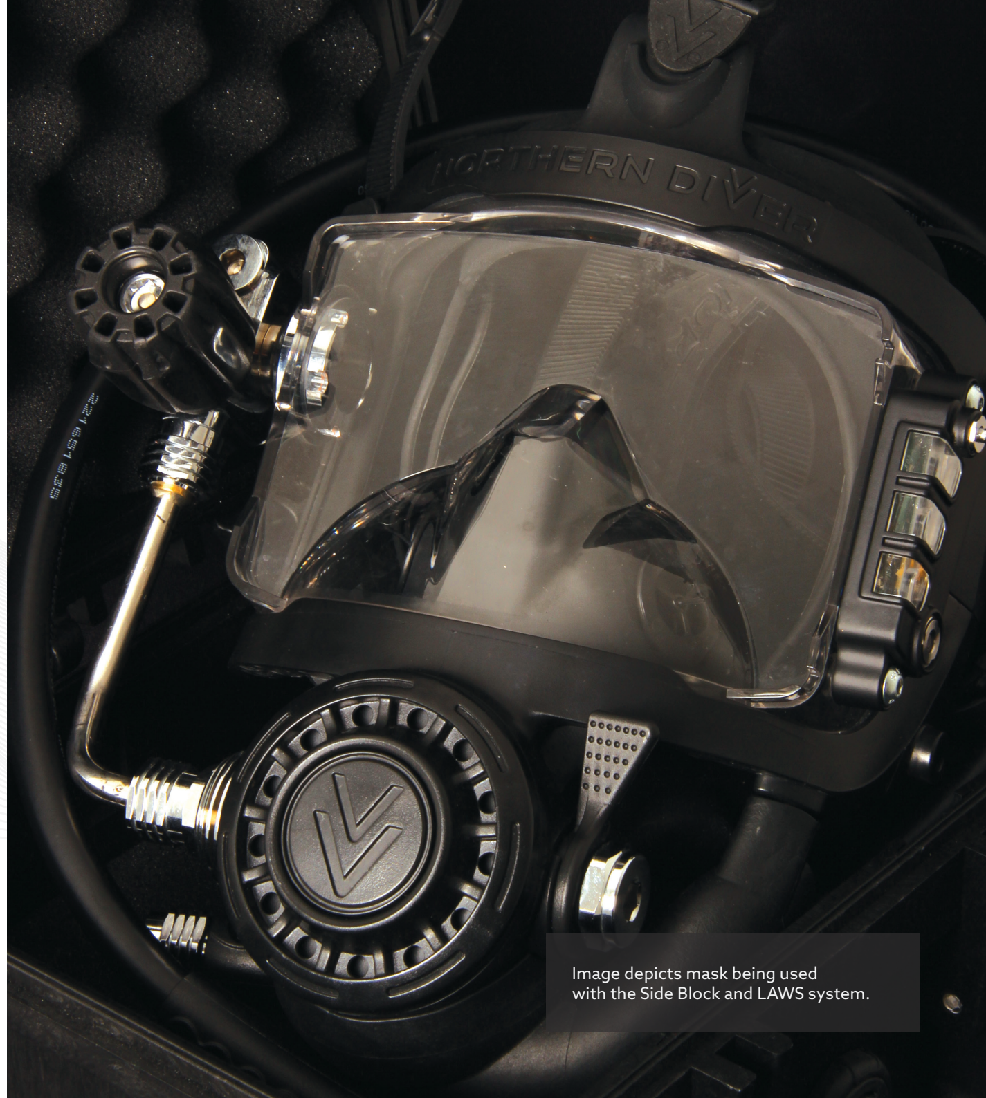
Image depicts mask being used with the Side Block and LAWS system.

Contact us today for more information, product demonstrations, or to secure your order.