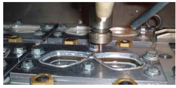
Luxurious aluminum alloy machined frame delivers the accuracy and quality without compromise.